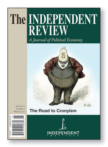
THE INDEPENDENT REVIEW WINTER 2019

Geoffrey M. Hodgson (Univ. of Cambridge) follows this with "Capitalism, Cronyism and Democracy." Although cronyism and corruption are less common in democratic countries than in non-democratic ones, statistical correlations don't settle the question of whether or not free-market