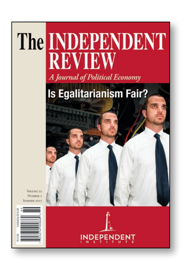
THE INDEPENDENT REVIEW SUMMER 2017