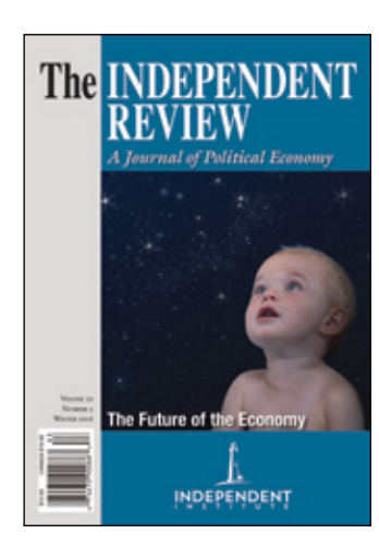
THE INDEPENDENT REVIEW WINTER 2016