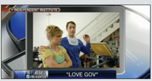
LOVE GOV FEATURED ON STOSSEL SHOW ON FOX BUSINESS NETWORK 9/25/15

—Abigail R. Hall in The Orange County Register, 10/1/15