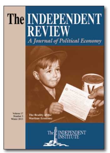
The Independent Review, Winter 2013