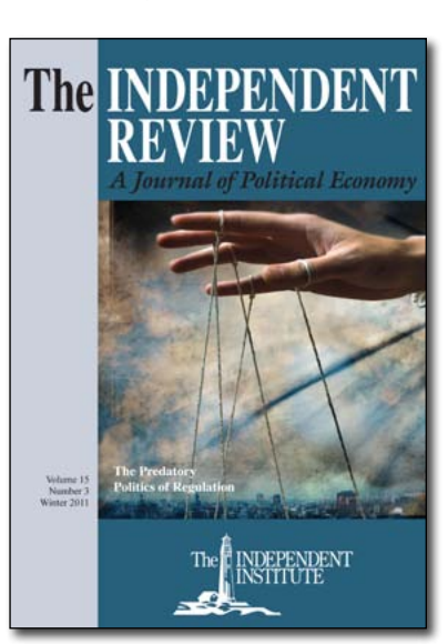
The Independent Review, Winter 2011

"The Failure of Nuclear Power" is available for free at www.independent.org/publications/tir/ article.asp?a=814.•