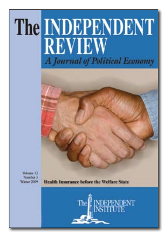
The Independent Review, Winter 2009

See www.independent.org/publications/tir/article.asp?a=713.