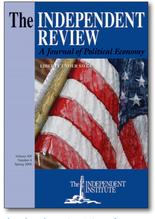
The Independent Review, Spring 2008

See www.independent.org/publications/tir/article. asp?issueID=53&articleID=681.