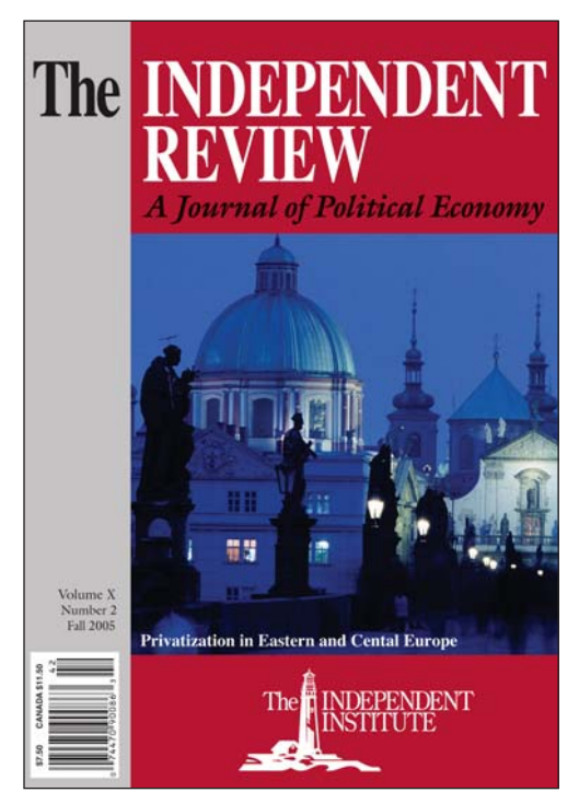
The Independent Review, Fall 2005

Shirley found that the reason for the unpopularity of privatization had little to do with its economic effect on most people. The privatization of infrastructure, for example, had resulted mostly in better financial and operating performance, extended coverage and improved access, and generally better services. Job losses didn't seem to answer the question,