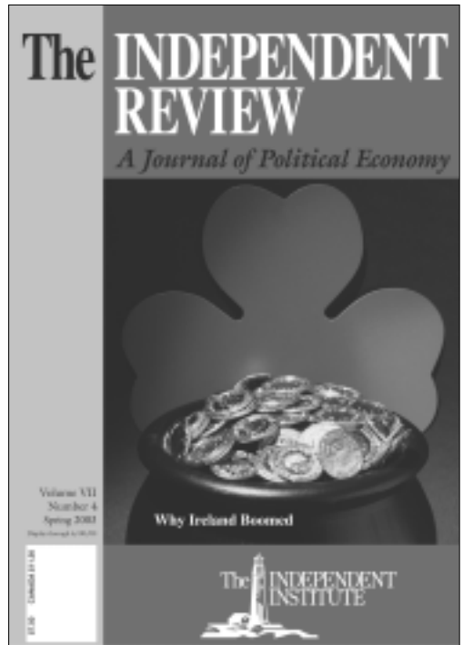
The Independent Review , Spring 2003.