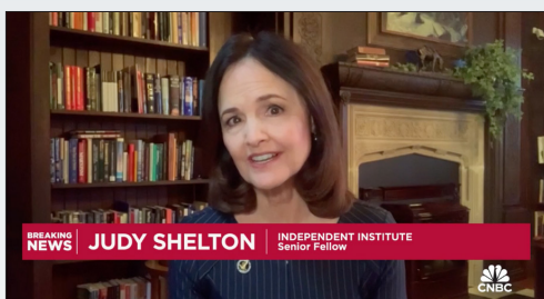
JUDY SHELTON ON CNBC, 1/26/24