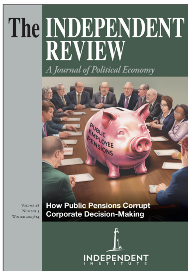
Explore thoughtful alternative solutions to issues of current and perennial concern in this issue!