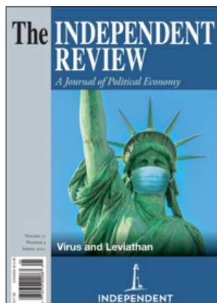
THE INDEPENDENT REVIEW SPRING 2021