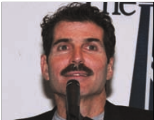
ABC-TV's John Stossel addresses the Independent Policy Forum on hucksters, cheats and scam artists.

• CONFESSIONS OF A MEDIA MAVERICK: Exposing Hucksters, Cheats, and Scam Artists (Jan. 30): Television journalist John Stossel (Host, ABC-TV's "20/20" and "John Stossel Specials") shared his insights about consumer protection, government failure, reckless lawsuits, and media bias, drawing upon his best-selling book, Give Me a Break .