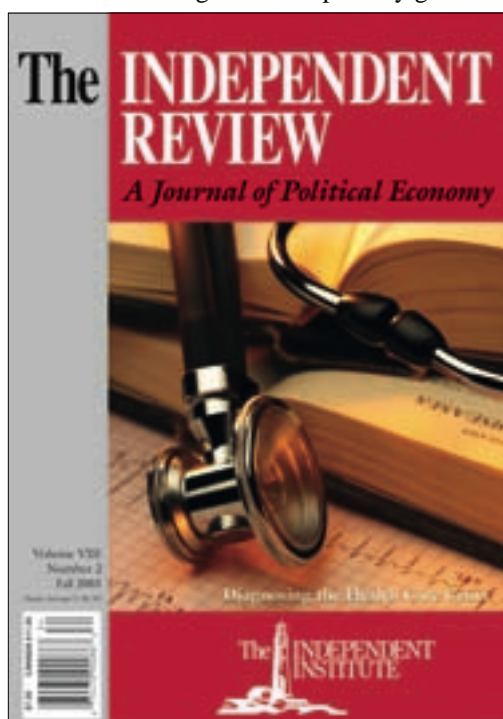
The Independent Review , Fall 2003.

In "The Benefits of Economic Freedom: A Survey," economist Niclas Berggren (Ratio Institute, Stockholm) surveys empirical studies on the relationship between freedom and wealth, and arrives at some important if unsurprising conclusions: small government, free markets, and a legal system that recognizes property rights contribute significantly to economic growth. "For countries with large public sectors, such as Sweden, which [by the Economic Freedom Index ] was ranked 120 out of 123 countries in 2002, this relationship implies that a reduction of public undertakings is to be recommended to the extent that growth is a primary goal."