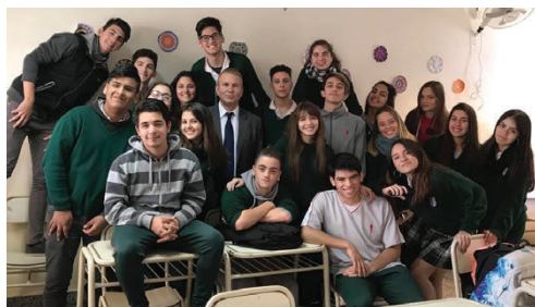
STUDENTS ENJOY CAMRADERIE AT LIBERTY WORKSHOP