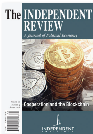
THE INDEPENDENT REVIEW SPRING 2018

Although the blockchain was invented to serve Bitcoin, entrepreneurs are developing other uses that overlap the realm of traditional government services. Examples include contract enforcement, automated contracts, regulation of corporations, assurance contracts, dispute resolution,