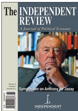
THE INDEPENDENT REVIEW SUMMER 2015