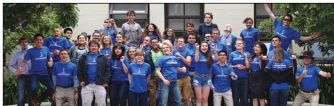
STUDENTS AT A CHALLENGE OF LIBERTY SEMINAR.

Each seminar offered ample opportunity for student-teacher