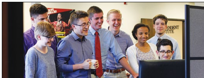
INDEPENDENT INSTITUTE INTERNS

Answering this question has to be a top priority. Because now, more than ever, young people are fed up with the lousy hand that government is dealing them ; skyrocketing tuition costs fueling massive student debt, a job market that offers precious little hope of paying it off, huge costs for healthcare and housing, and incessant government spying.